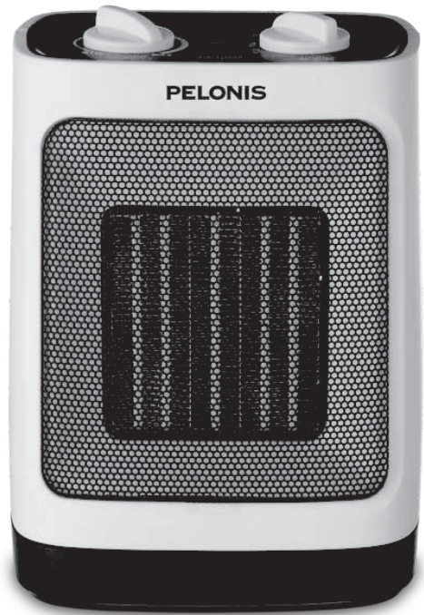
PORTABLE OSC CERAMIC HEATER MODEL: NTY15-16LA