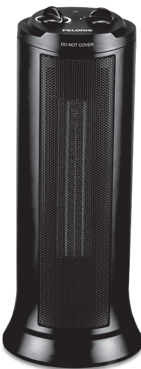
CERAMIC TOWER HEATER MODEL: HC-2017